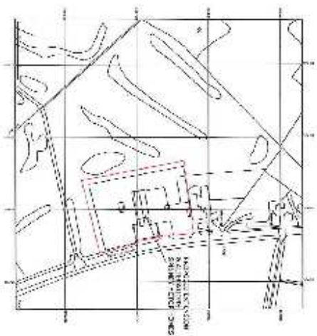
SITE PLAN SCALE 1 : 2500