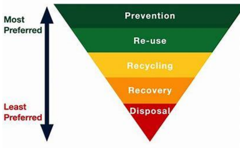
Figure 2: waste hierarchy diagram

29 A key aspect of the specification issued as part of the procurement and eventual contract will be to promote a focus on the waste hierarchy, as set out within Figure 2.