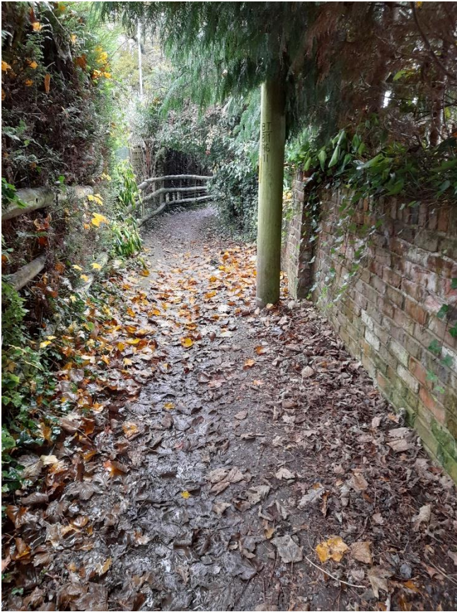
Enclosed route round \moss cottage