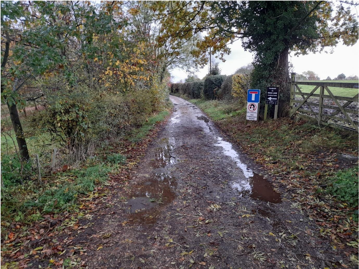
No through route sign and footpath to Moss Lane sign adjacent to FP45 south