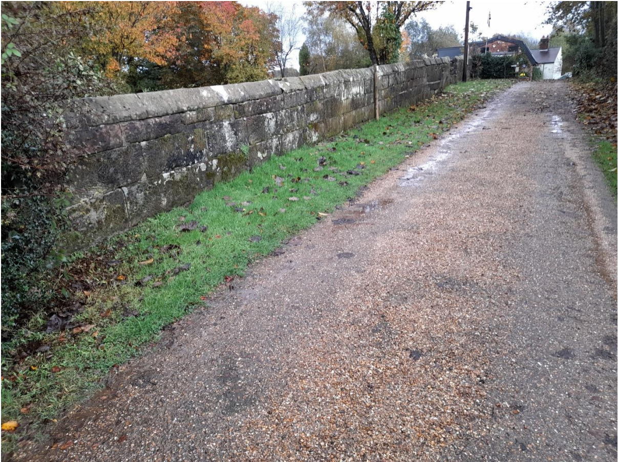
Wall adjacent to the quaker graveyard