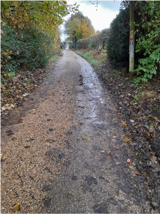
Post includes signs for the cottage and the lodge and no through route sign