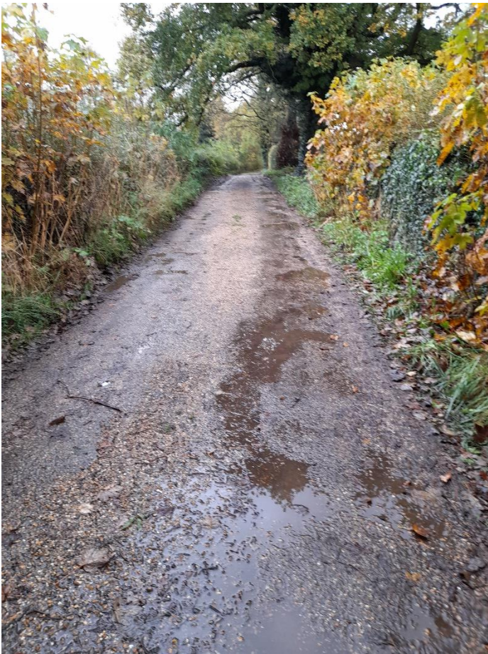
gate before Newton Farm entry/FP45