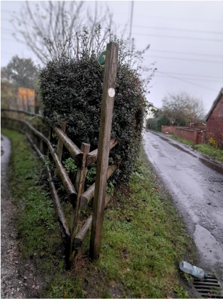
Moss Lane finger post with BW blade