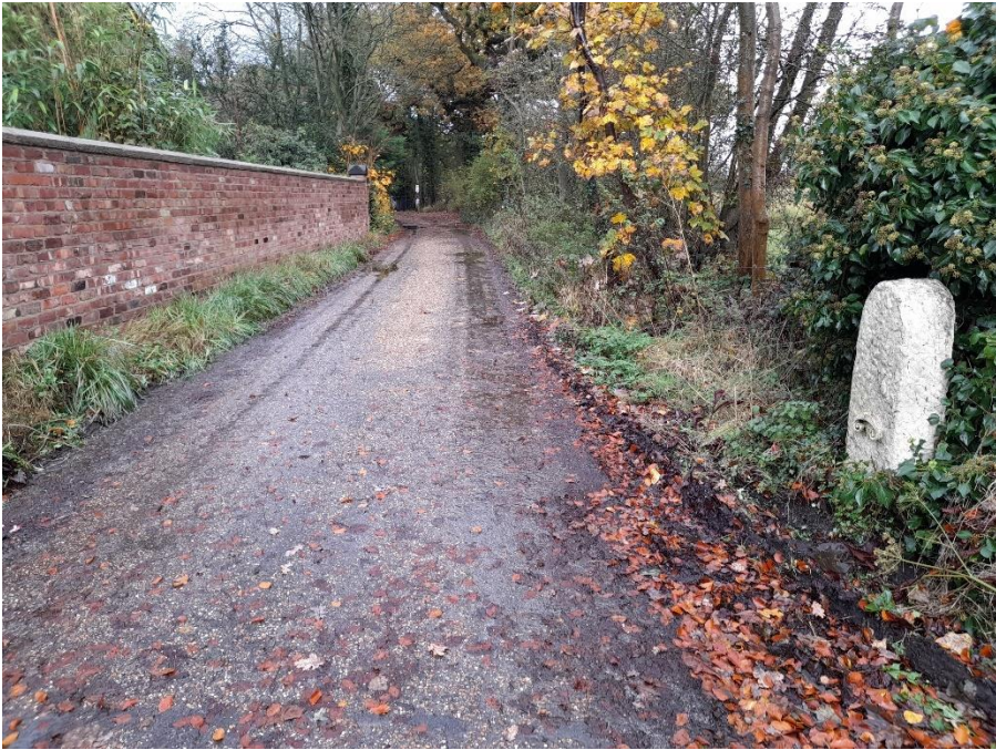
gate posts point A