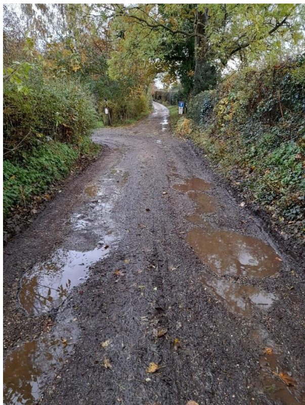
FP45/finger post with BW blade