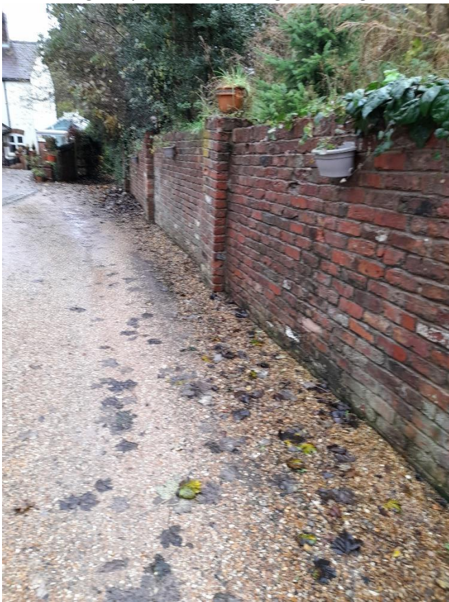
Wall at edge of yard for the cottage/the lodge