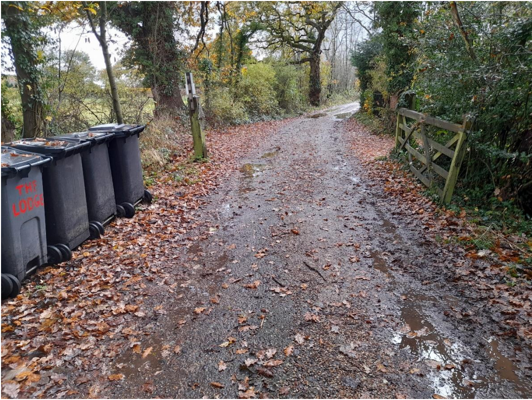
Gate in area before FP44