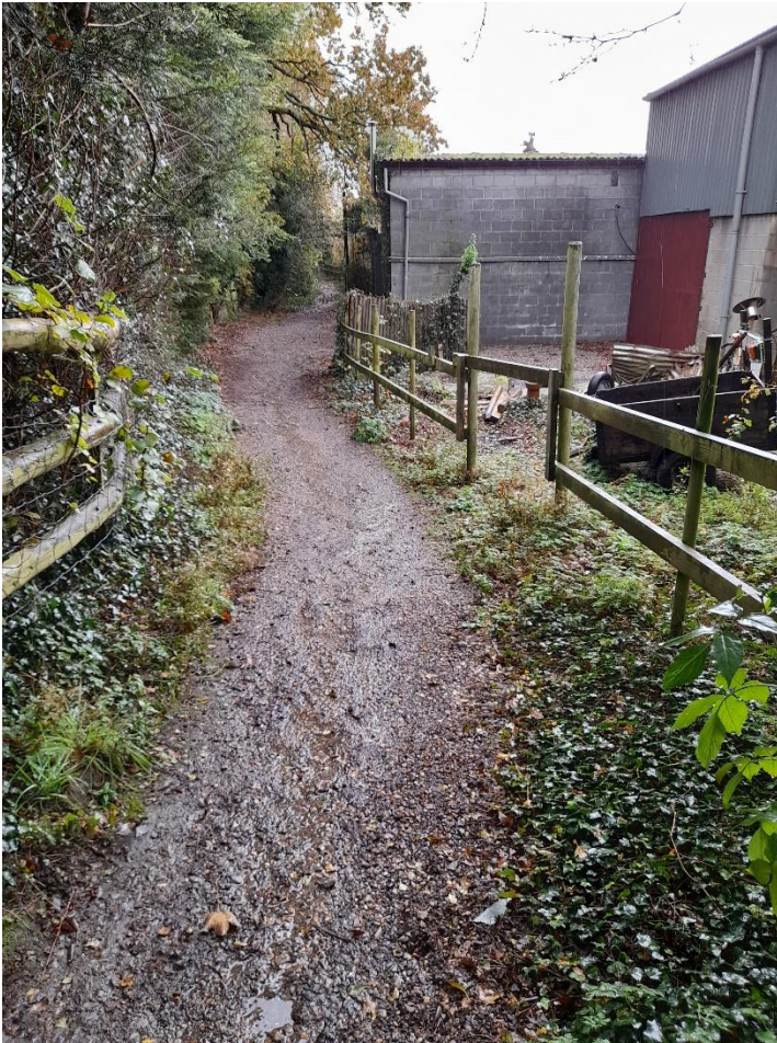
Buildings associated with moss cottage,