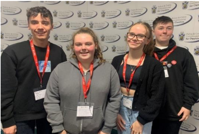
Cheshire East Youth Council Members

We feel that getting the plan right and following through with actions will mean that Cheshire East continues to be a great place to be young and provide a brighter future TOGETHER .