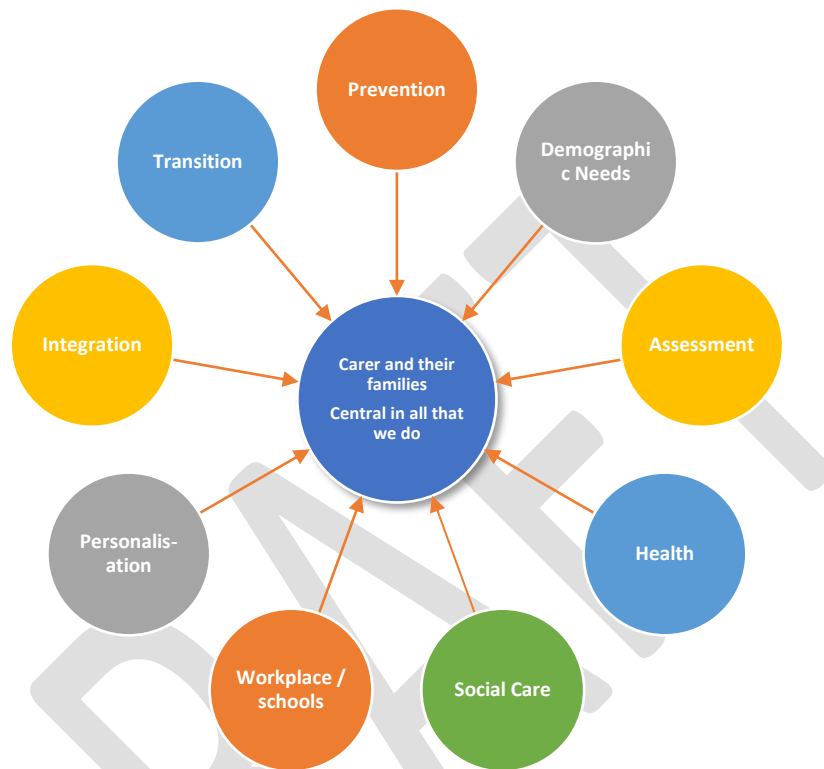
Figure 1: Elements of caring that need to be addressed

Carers play such an important role in all that we do. The diagram above (Figure 1) shows that with every health and social intervention there is a carer involved. If we ensure that there are clear pathways for carers in all of the highlighted circles it will allow us to deliver the right support at the right time. For example, Young carers need to be identified as early as possible, so they receive the right support; a carer identified within their G.P practice to ensure they receive the right support at the right time.