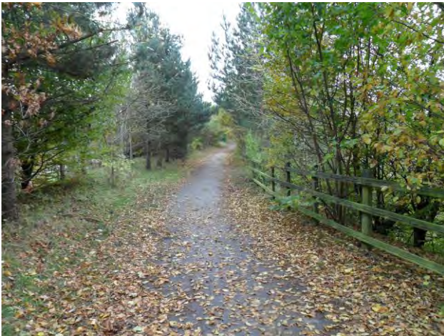
Middlewood Way showing section without lighting