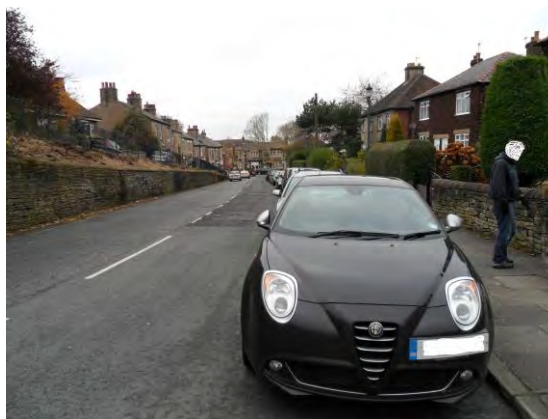
Grimshaw Lane and suggested crossing point