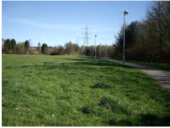
Section on Middlewood Way with lighting