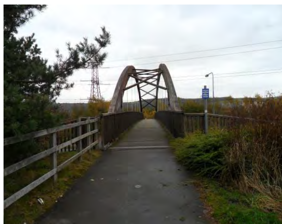
Bridge over Silk Road