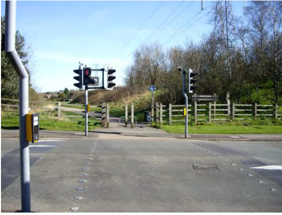
Toucan crossing on Brocklehurst Way