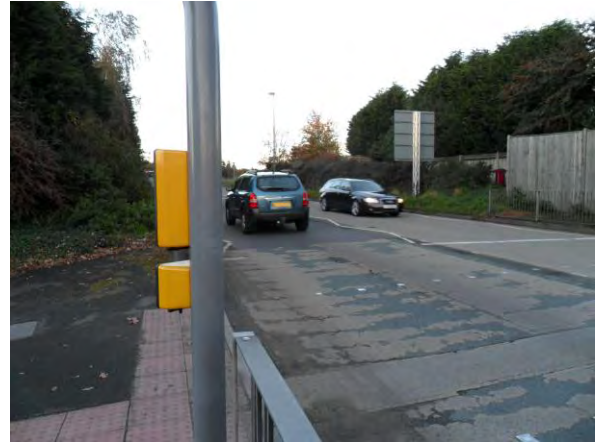
Toucan Crossing A500