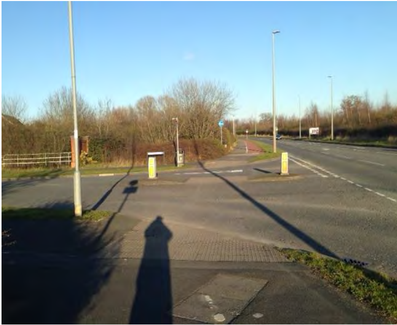
Burnell Close crossing