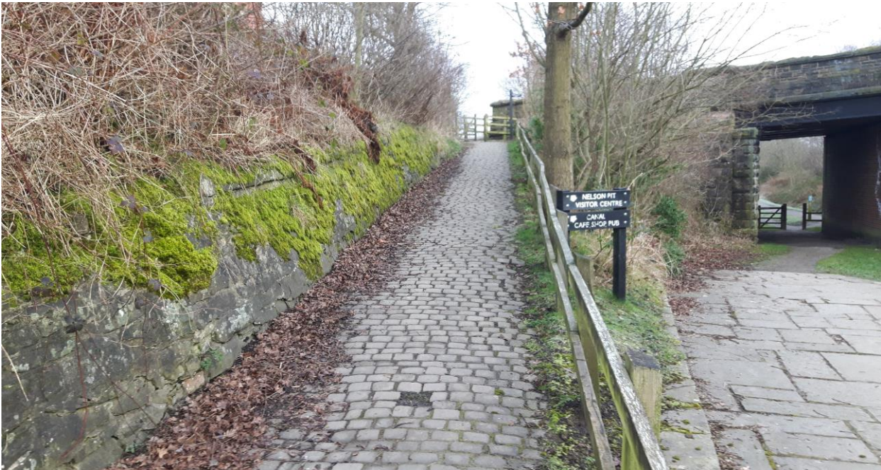
Shrigley Road North