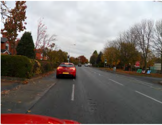
Crewe Road puffin crossing