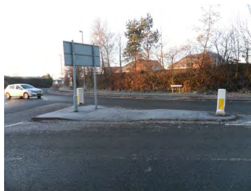
Elworth roundabout at Elton Road