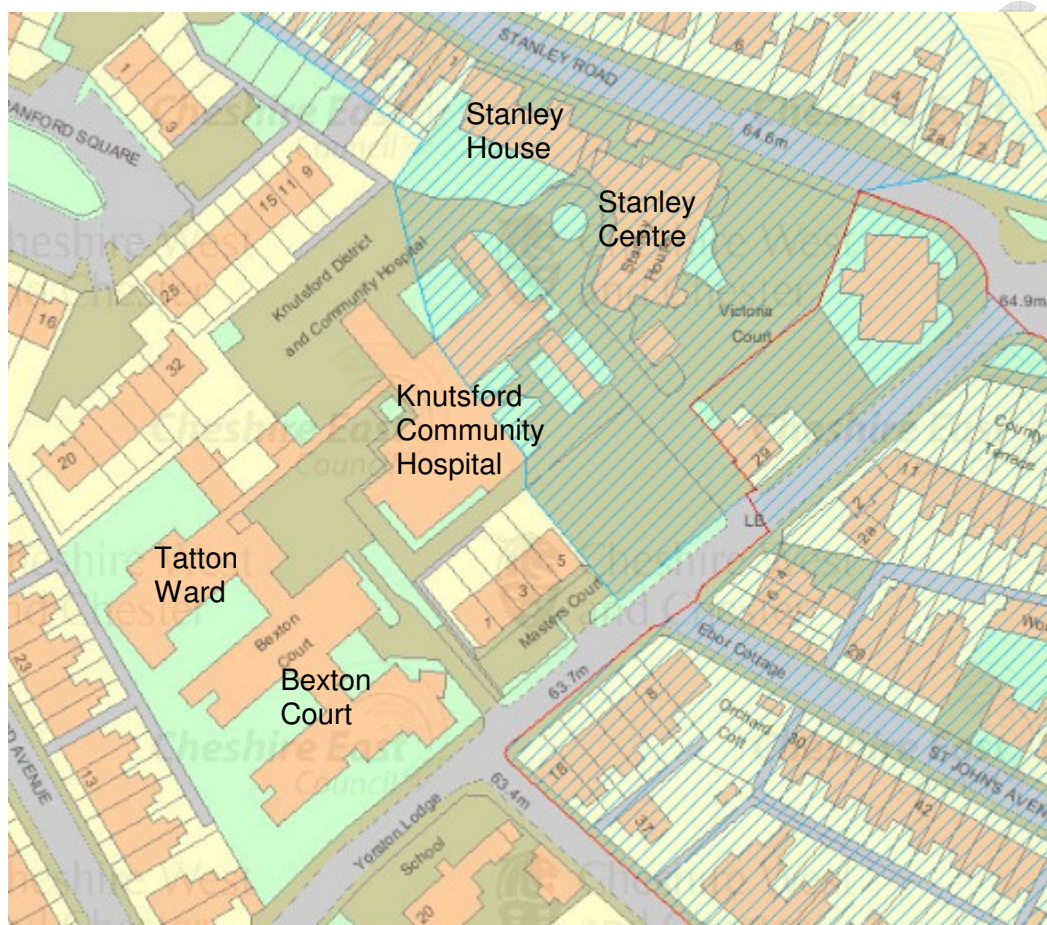
Knutsford Community Hospital, Bexton Road