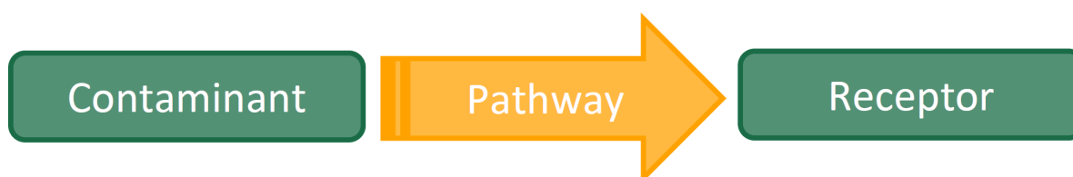
Figure 5.1 Contaminant linkage