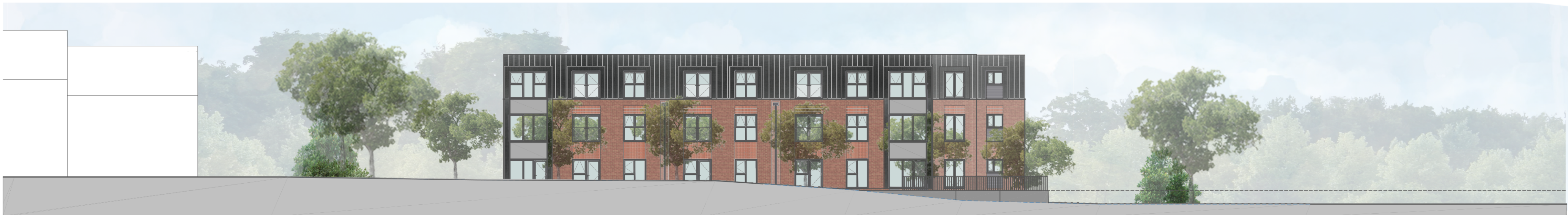
West Side Elevation