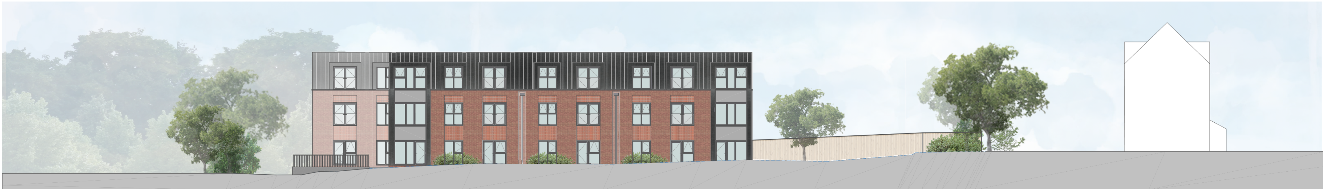
East Side Elevation